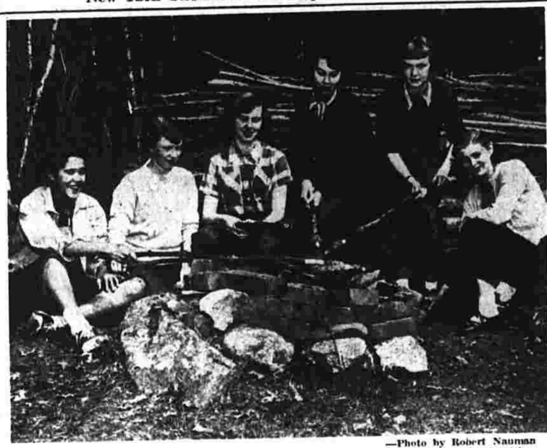
Some of the members of Senior Girl Scout Troop 555 from Manhattan, posing here with members of local Girl Scout Troop 1 of Manchester yesterday at Camp Merri-Wood here.